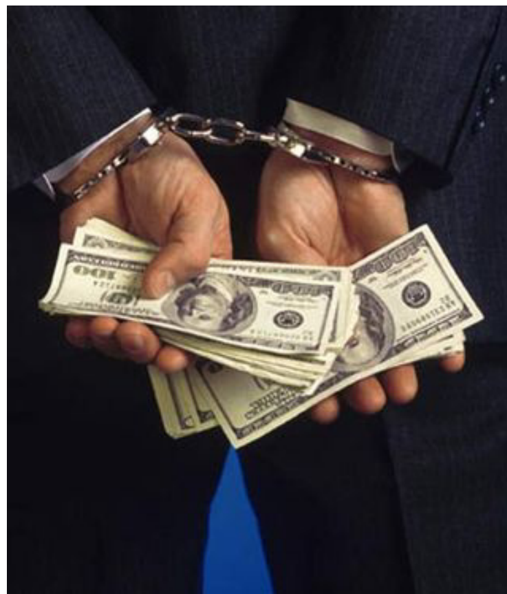
Financiers Do the Crime But Not the Time