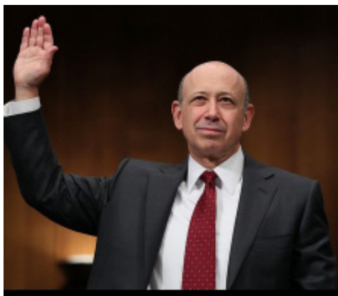
Lloyd Blankfein, CEO Goldman Sachs

Carl Levin, chair of the Senate Permanent Subcommittee on Investigations, will recommend that Goldman executives who testified before his panel, including chairman and chief executive Lloyd Blankfein, be referred to the Justice Department for possible criminal prosecution, the Michigan Democrat