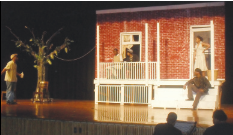
August Wilson’s Fences presented at “The High” during Maafa week.

For the past 12 years Boys and Girls High School has held its “Maafa” - a week of performances, workshops, forums and other activities highlighting the history and culture of people of African-descent. Maafa is a Swahili word which means the “Great Suffering” and is used to memorialize and pay tribute to the millions of enslaved Africans who endured the horrors of the trans-Atlantic and Arab slave trade.